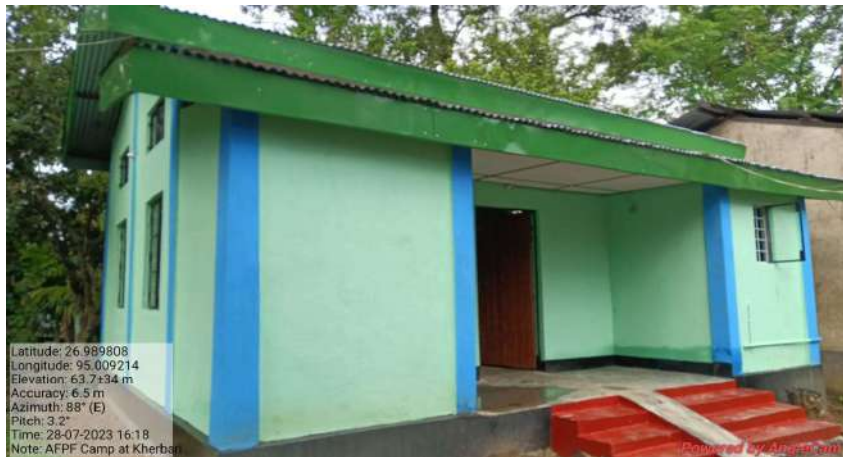
AFPF Barrack, Kherbari