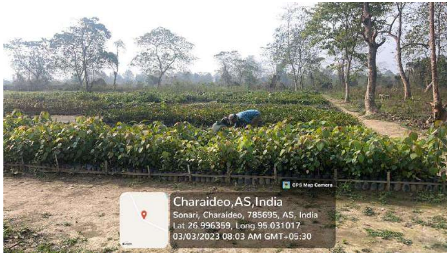
50 ha. AR Site Nursery