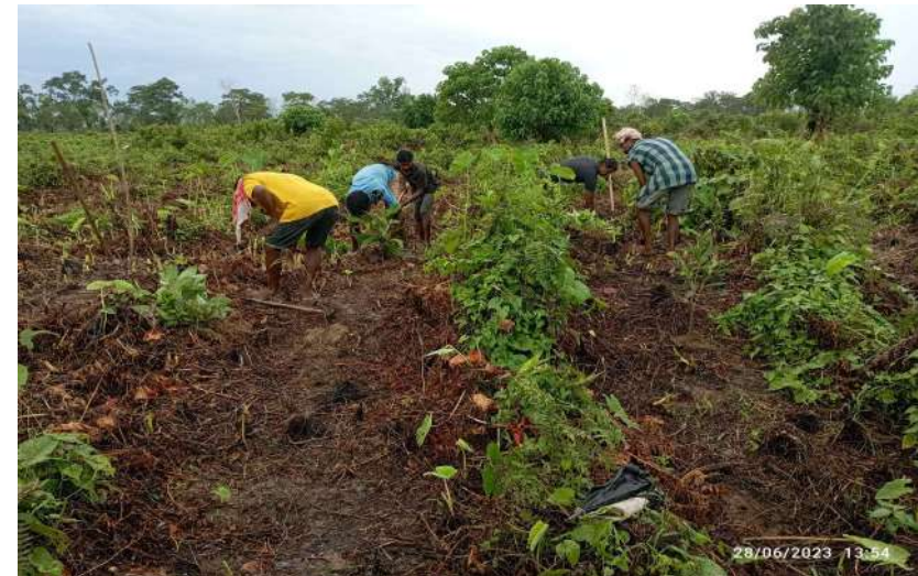
50 ha. AR Plantation