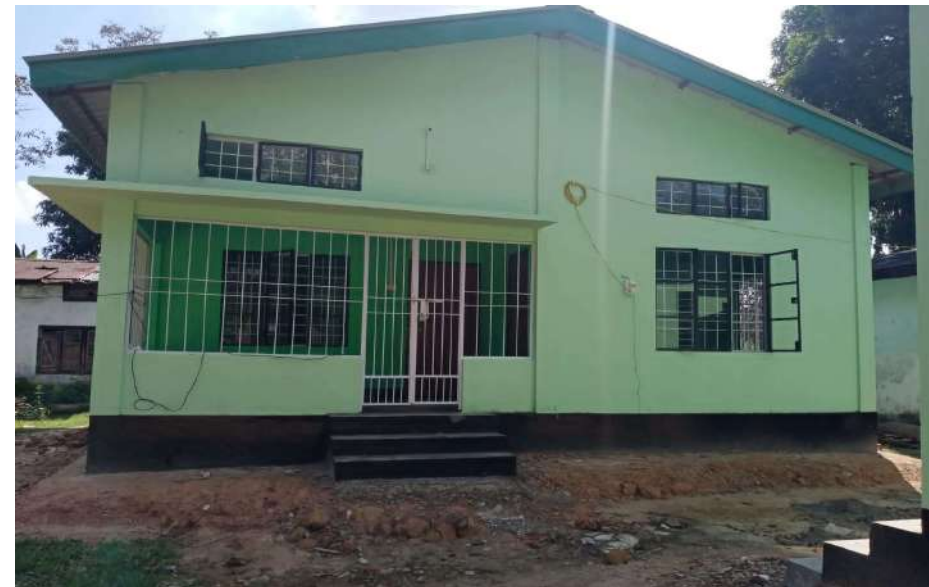
Beat Office Building, Sonari