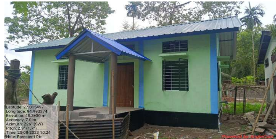
Fr-I quarter, Sonari