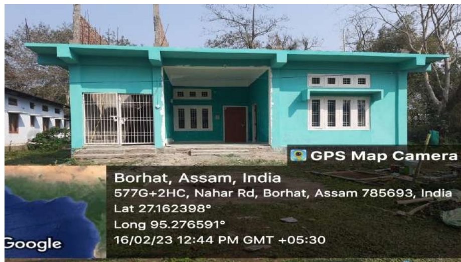
Range Officer Quarter, Borhat