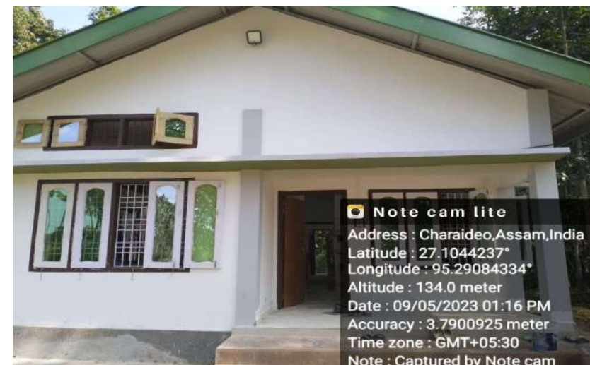
AFPF Barrack house, Halua Beat