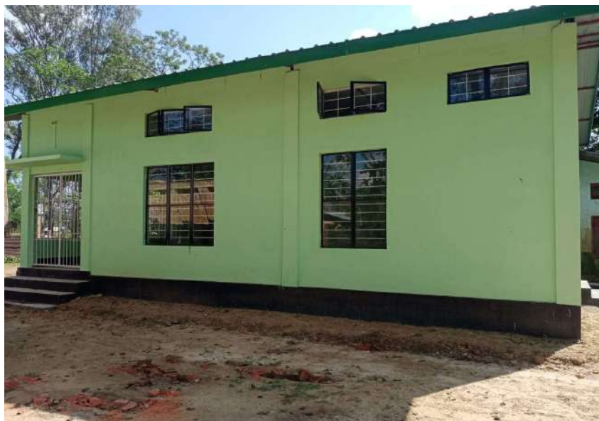
Range Office Building, Sonari